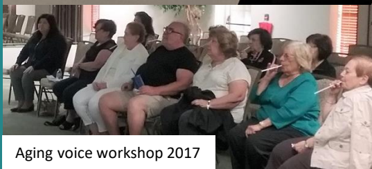
Aging voice workshop 2017