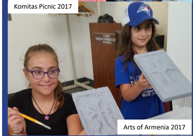
Arts of Armenia 2017