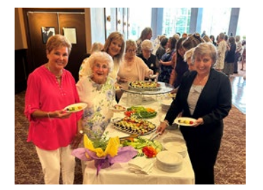
Time for dinner!