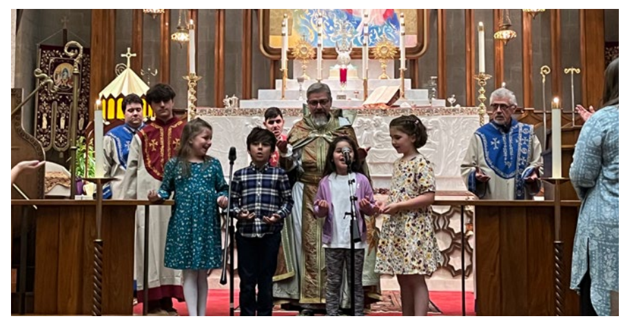
The elementary students recite the Hayr Mer in church as a concluding activity of their Church School Year.