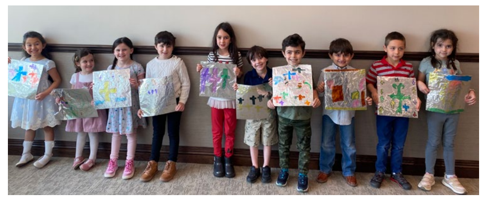
The Kindergarteners display the Bible Book covers they designed like the ones they see each Sunday in church.