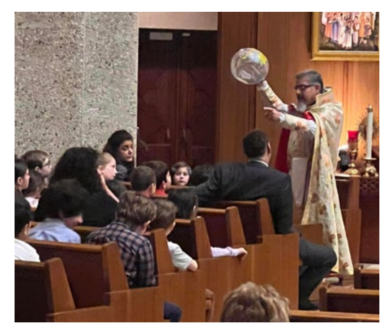
Even beach balls are teaching tools during the Youth Sunday sermons.