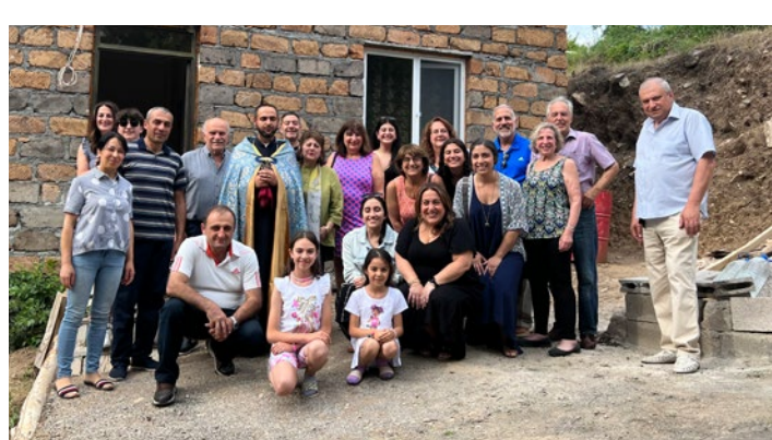
The blessing of the Smbatyan home.