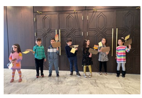
The Kindergarteners are sailing their boats through a storm, just as Jesus and the disciples did.