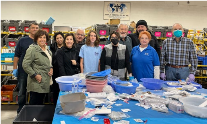
World Medical Relief volunteers