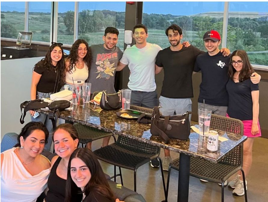
Top Gold night