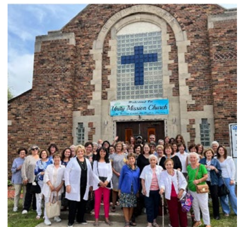
In front of “old” St. John's on Oakman Blvd (now Unity Mission Church)