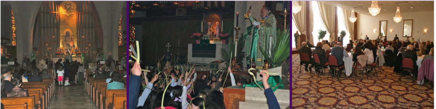
Palm Sunday Services • ACYOA Day Tea