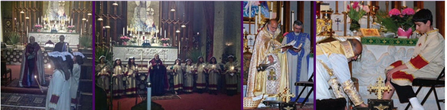
Remembering the Wise & Foolish Virgins - Great & Holy Tuesday • Washing of the Feet - Great & Holy Thursday