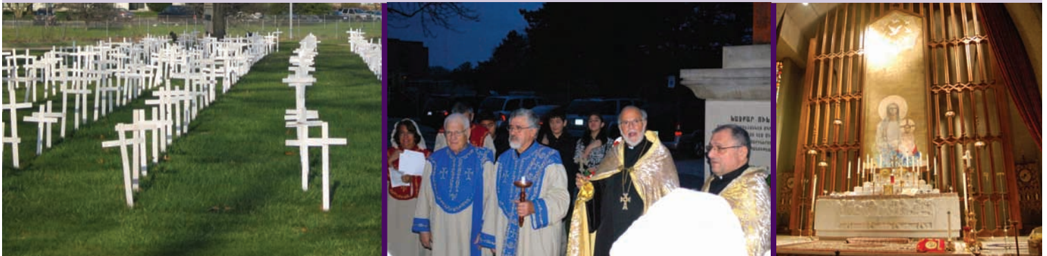
The ACYOA White Cross Project • Commemorating Martyrs Day Monday, April 25 th