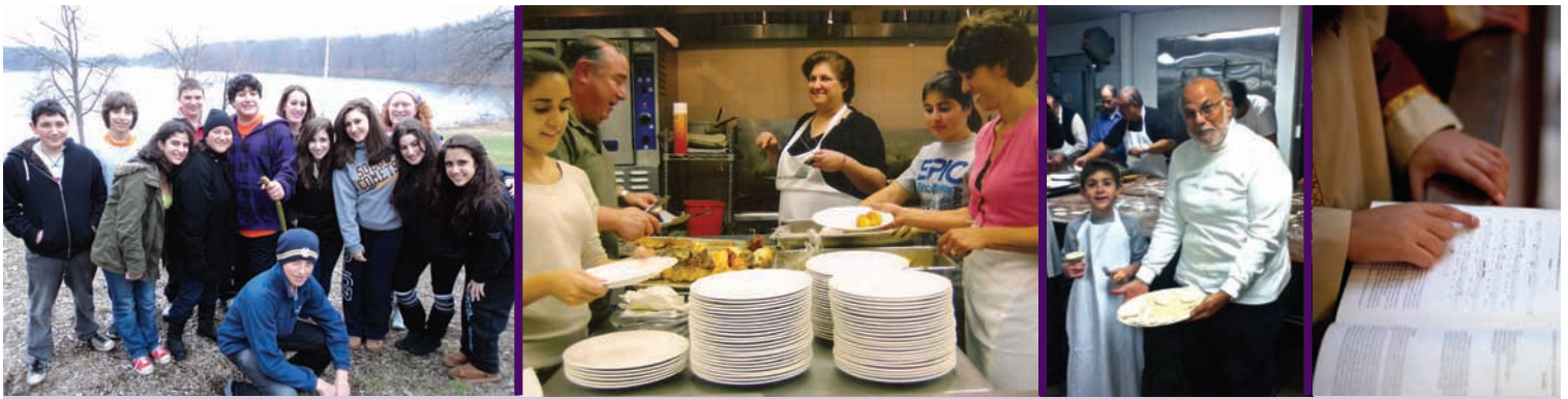
ACYOA Lenten Retreat • ACYOA ever popular Lobster Dinner • Nushkhars for Easter Sunday