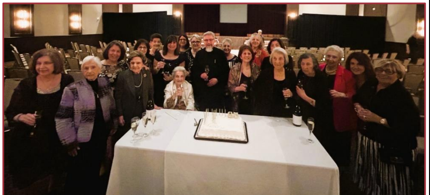
WOMEN'S GUILD PAST CHAIRMEN CANDLE LIGHTING TOASTING