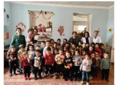
Nerkin Karmiraghbyur Kindergarten

In 2024 CASP will be supporting all 256 children, including the 9 from Artsakh. The annual cost is $110 per child for a total of $28,160. Please consider an additional donation to support this very important project.