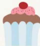
FRIENDSHIP & FUN