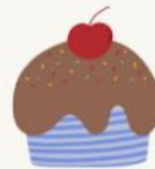
BAKED GOODS DONATIONS